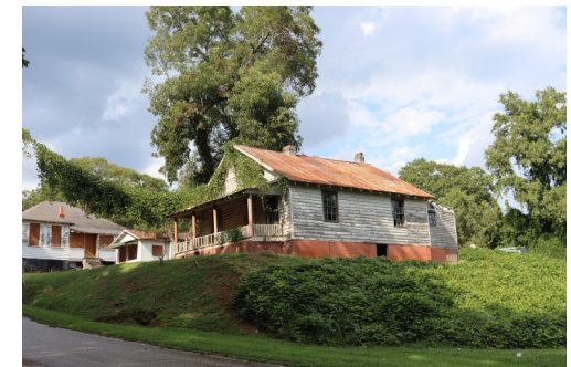
Vacant lots and housing dot Winnsboro